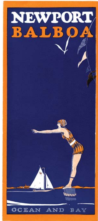
Tourist brochure, 1930. Newport Beach Chamber of Commerce Records.

This collection includes correspondence, reports, contracts, plans, specifications, bonds, and other documents relating to the early twentieth century development and construction of portions of Newport Beach, California. A significant volume of the material in the collection relates to the city's street system and includes documents related to improvements, paving, closures, and openings. In addition to numerous bonds and contracts filed with the City of Newport Beach for work varying from plumbing to garbage pick-up, the collection also contains items related to the construction of bulkheads and the dredging of Newport Harbor.