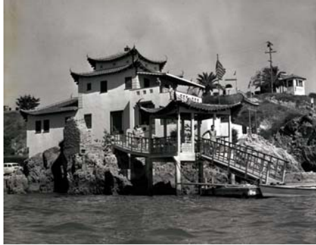
China House, undated.