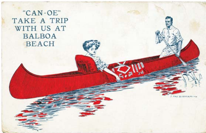
Postcard—"Can-oe" Take a Trip With Us at Balboa Beach, 1909. Sherman Library Postcard Collection

This collection consists of postcards from all over Southern California. The roughly 400 postcards depicting Newport Beach include beach, harbor and street scenes, the Pavilion, hotels, and Balboa Island scenes.