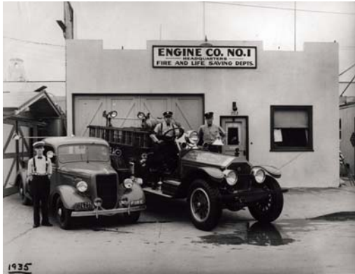
Engine Co. No. 1, 1935.

R. J. Briscoe was a member of the Newport Beach Fire Department starting in 1931. This collection contains photographs of Newport Beach, especially relating to natural disasters, such as fires, floods and earthquakes.