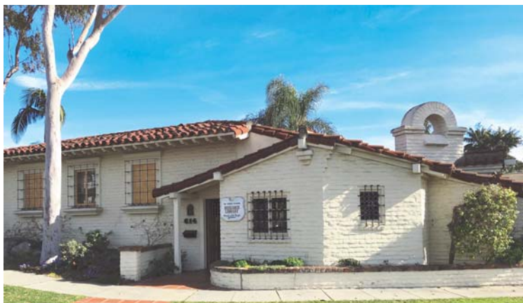
Sherman Library, Corona del Mar, CA

No part of this publication may be reproduced without written permission from the Sherman Foundation.