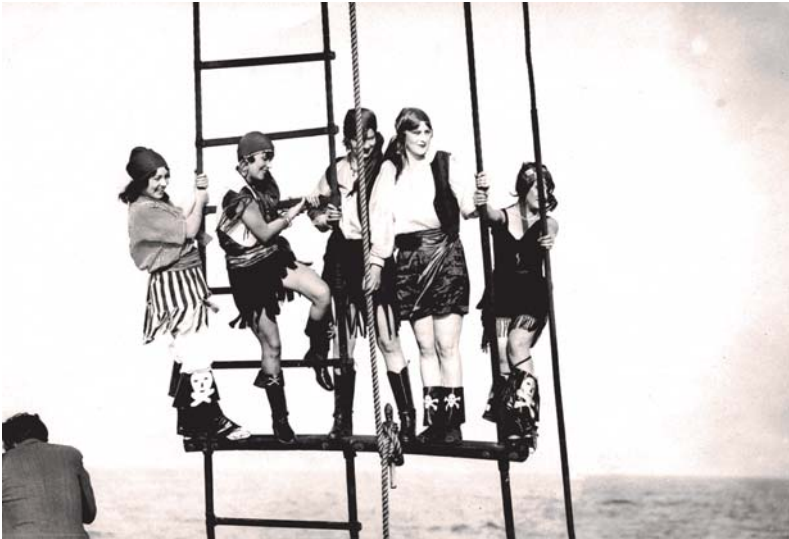
Newport Harbor Yacht Club pirate cruise aboard the Lily on September 9, 1928.

collection includes images taken in and around Newport Harbor, including jetty construction, dredging, sailboat and speedboat races, NHYC facilities, officials and events, the Tournament of Lights, beach scenes, and the Balboa Yacht Club. The collection includes a large number of images of yachts ported in Newport Harbor.